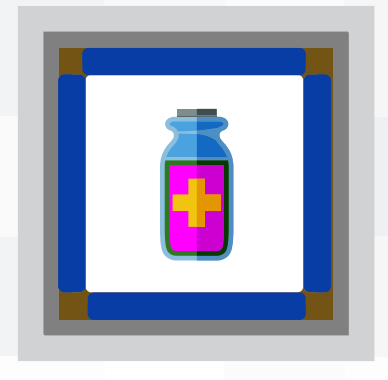
GLOBAL EPS + VIP Solutions