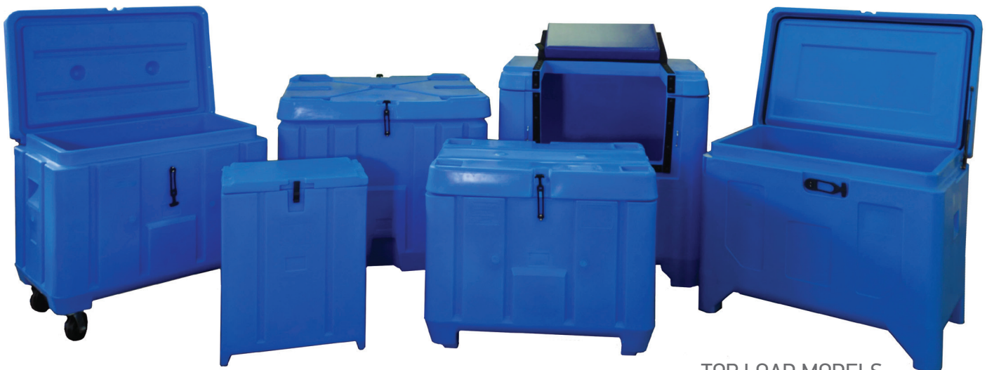
TOP LOAD MODELS

Ranging in various sizes and styles, these durable insulated containers make storing, transporting, and unloading efficient and worry-free. High impact polyethylene can handle the rigors of transport: the tight fitting lid and container construction, maintains temperatures, and maximizes shipping and transporting efficiency. Pre-qualified solutions available.