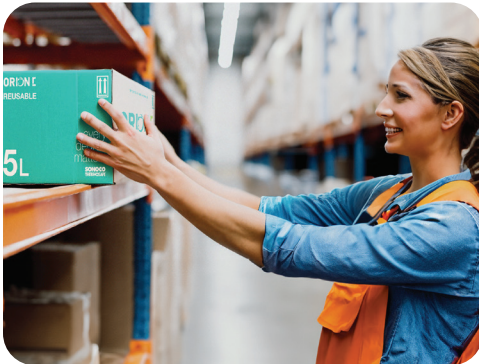
Learn How One Pharma Company Simplified Operations with Orion r®

Warehouse Operations Manager, Mid-size biotech company