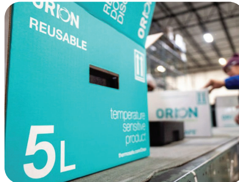
Case Study: Creating a Sustainable Supply Chain in a Circular Service Model