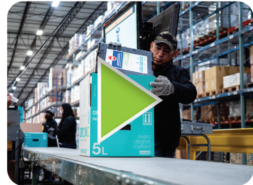
Watch: Behind the Scenes at an Orion r® Global Rental Station